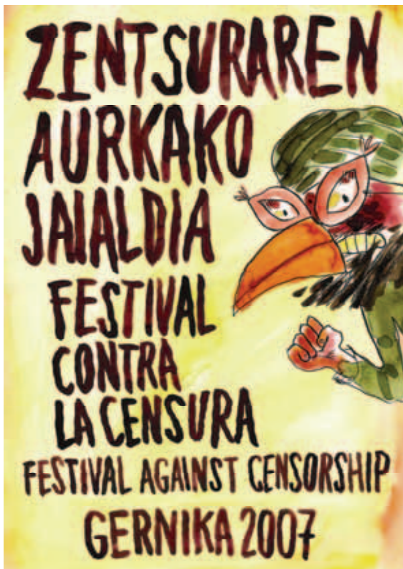
Poster: Zentsuraren aurkako jaialdia / Festival contra la censura / Festival against censorship.