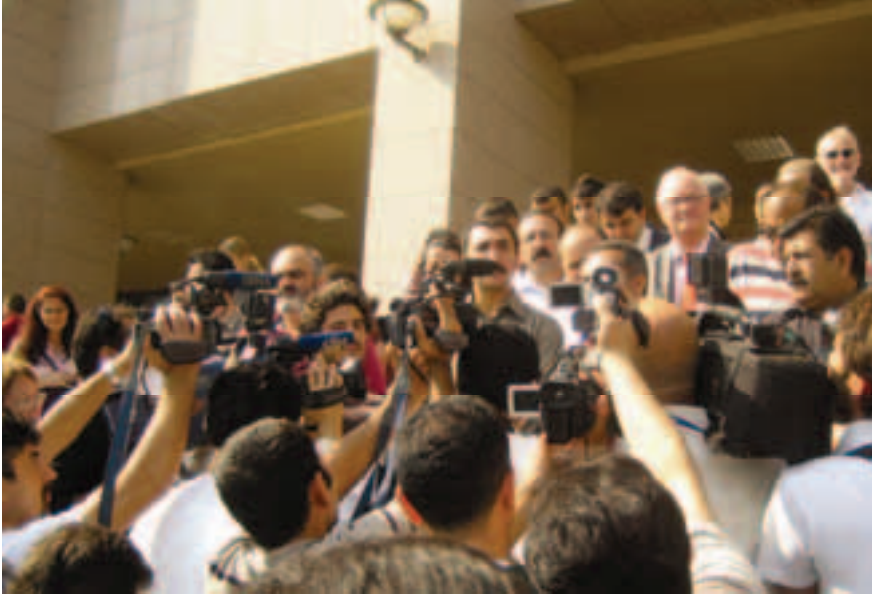
After the trial: Press meeting outside the court house in Izmir.